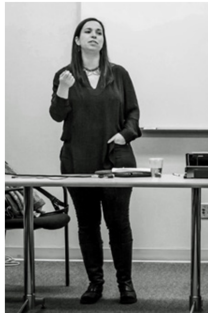
VENDLER READING GROUP