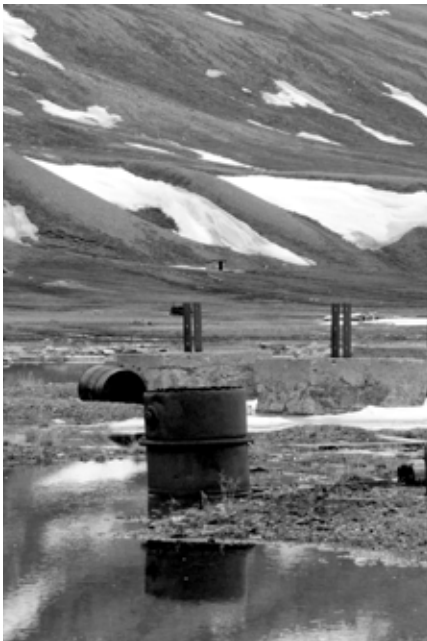
BEYOND PETROCULTURES (ENERGY IN SOCIETY)

The Institute funded three new working groups in the 2016/17 academic year and one returning working group.