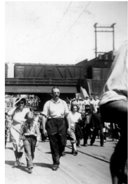
VISUAL RESEARCH WORKING GROUP