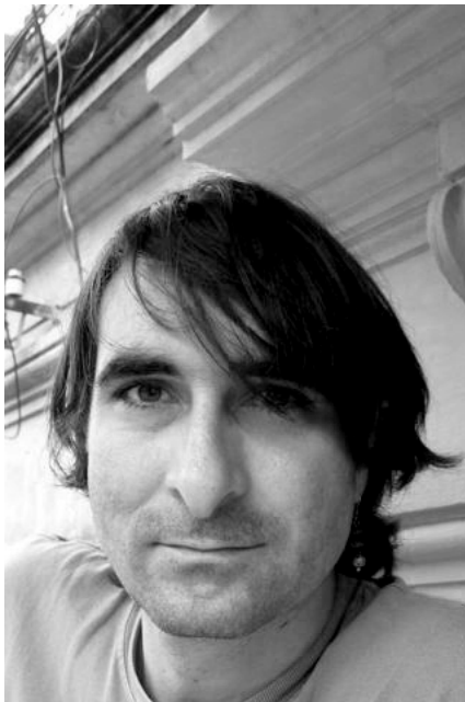
MARXISM & ITALIAN THEORY