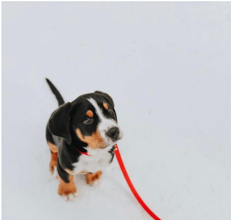
Boris the Swissy

Congratulations to everyone included in the Monday Memo! The department recognizes your hard work and dedication. Keep it up!